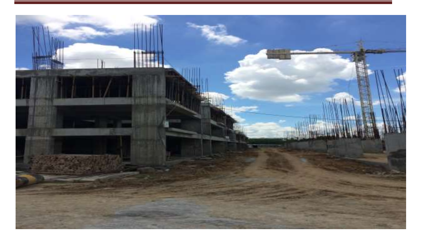
In Block C2: Excavation work, Shuttering for Short Column and for Pile cap Works on progress.