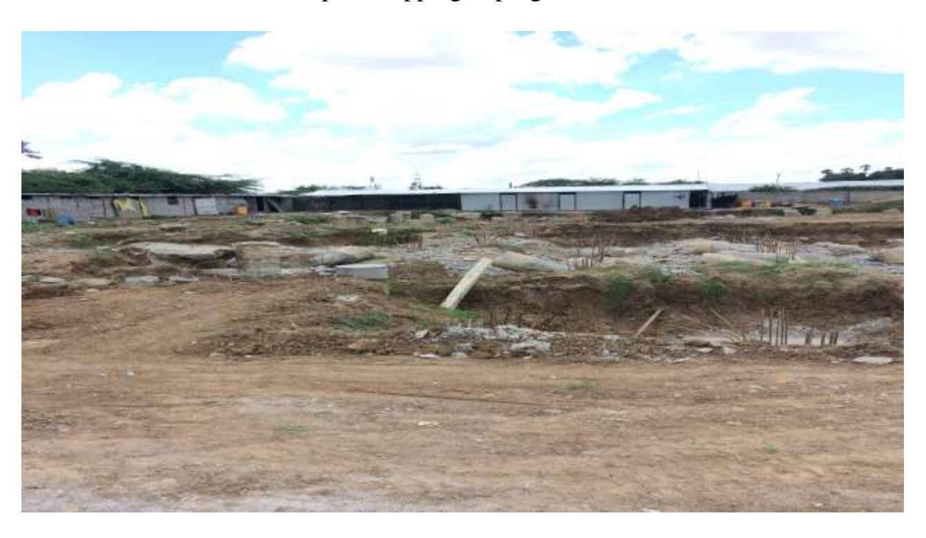
In Block A2: Excavation and pile Chipping in progress..

In Block A1: Excavaion and pile Chipping in progress..