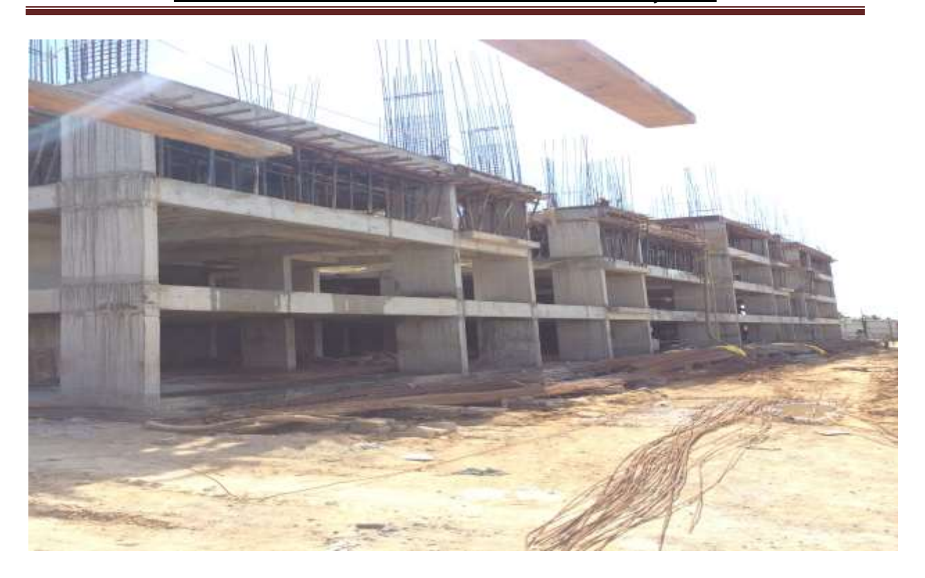
In Block D3: Second half of First floor level Shuttering and Bar bending Works are in Progress.