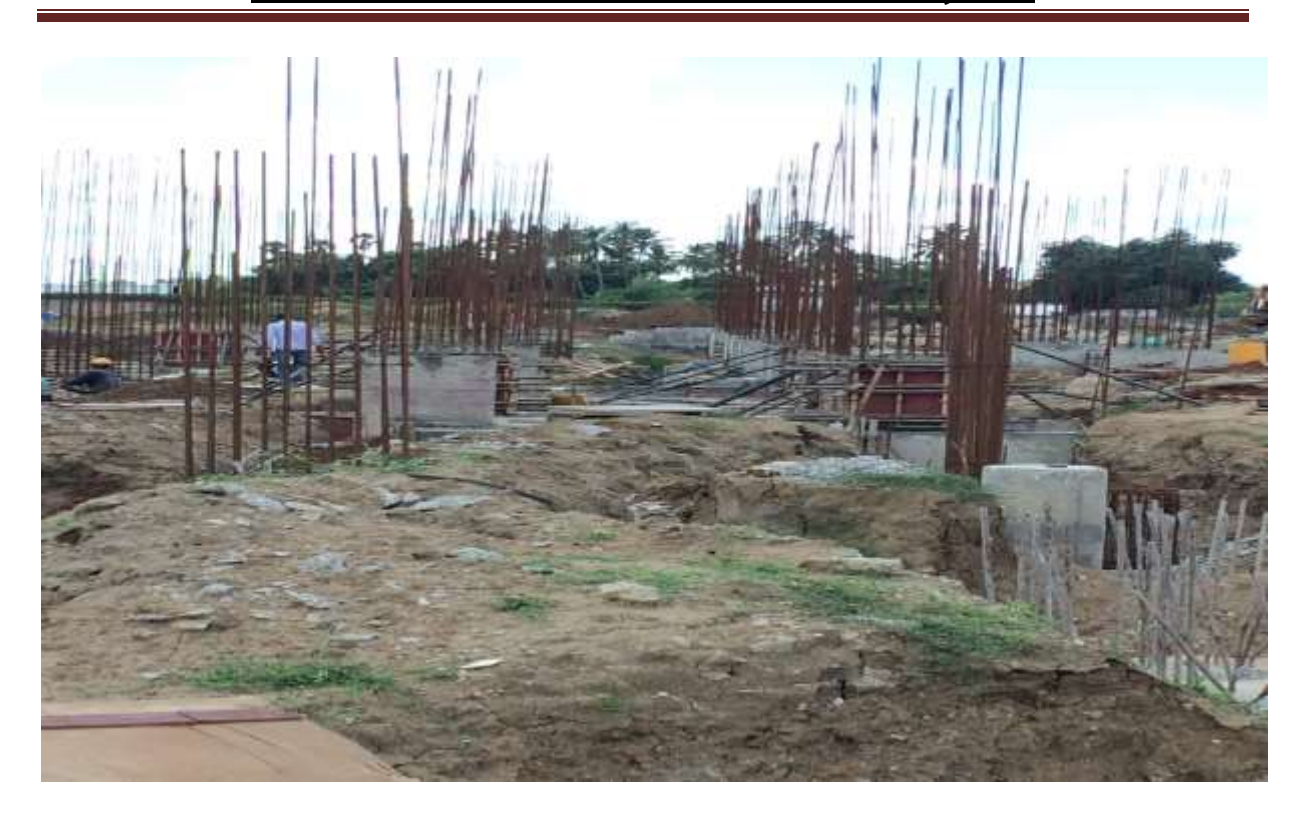
In Block D1: Excavation, Bar Bending & Shuttering for Pile cap work on Progress.