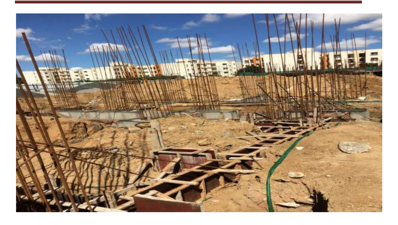
In Block D2: Shuttering & Bar bending Works on Progress for First half of Fourth Floor Level Slab.